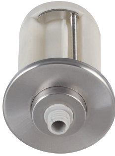
Shown approximately 75% of actual size.