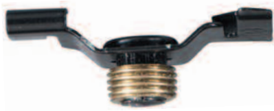
Shown approximately 130% actual size.