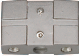
Shown approximately 110% actual size.