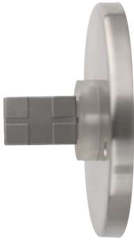
Shown approximately 40% actual size.