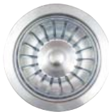
Sink Strainer Optional