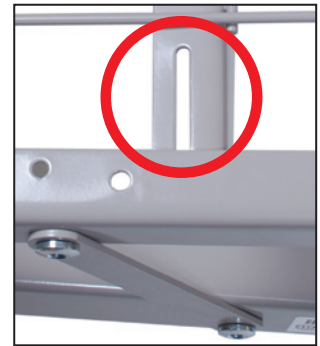
Patent Pending Rail Slots