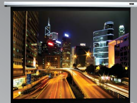
(shown here with Spectrum)