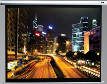
(shown here with Spectrum)