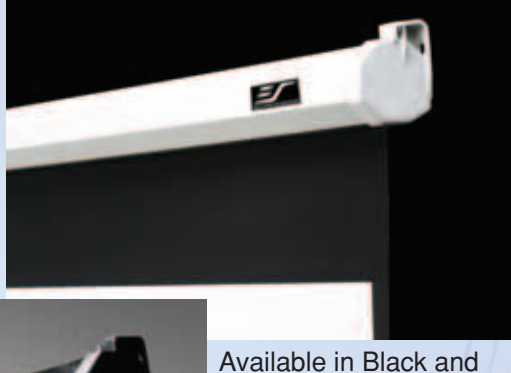
Available in Black and White Casing Colors.

Optional 6", 12" or 18" Brackets can always provide more flexibility with an installation. Please contact your reseller or visit shop.elitescreens.com for accessory parts.