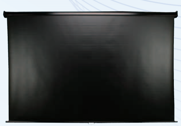
Black-Backed Screen Material

Lanyard Included for Convenient Operation