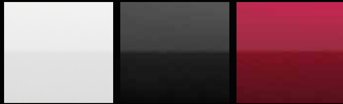
0100-03 / 0105-03. White lacquer.