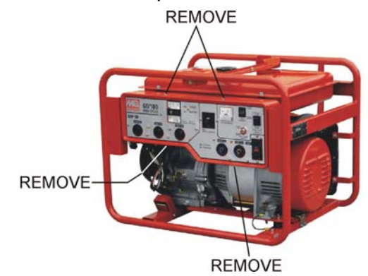
Figure 1. GDP-5H Control Panel Removal

3. After the four front panel bolts have been removed, pull the control panel forward and tilt downward. To support the control panel, place a wood block underneath as shown in Figure 2.