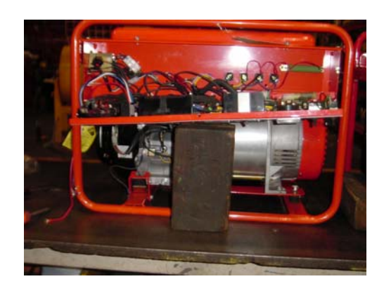
Figure 8. Control Panel Support Block

3. After the six front panel bolts have been removed, pull the control panel forward and tilt downward. To support the control panel, place a wood block underneath as shown in Figure 8.