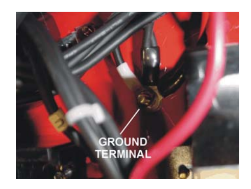
Figure 5. Ground Terminal

7. Route the black wire from the capacitor module as necessary, securing with tie-wraps and connect it to the generator ground terminal as shown in Figure 5. Note: it may be necessary to fold the black wire due to its length.