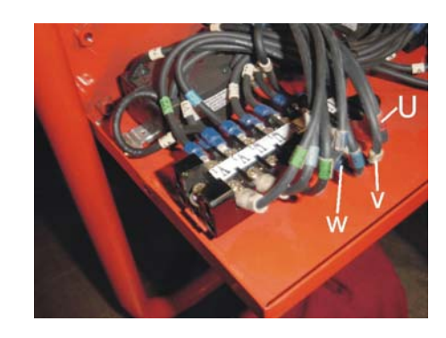
Figure 13. Terminal Board Connections

8. Route and connect the RED wire on the capacitor module to the U position (contact) on the terminal board as shown in Figure 13. Connect the WHITE wire to the V position (contact) and connect the BLUE wire to the W position (contact) on the terminal board. Use Tie-wraps to secure all wires.