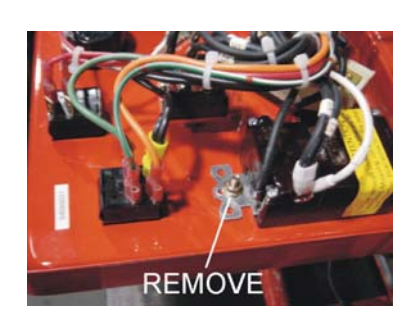
Figure 3. (GFCI Receptacle)

4. Remove the hex nut and machine screw from the GFCI receptacle (5-20R) as shown in Figure 3.