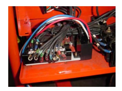
Figure 11. Terminal Board Installation

Install the mounting bracket underneath the terminal board (Figure 11). Align the holes on the on the mounting bracket with the holes on the terminal board. Insert the screws and associated hardware into the terminal board mounting holes and tighten securely.