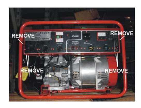
Figure 7. GDP-5000H Control Panel Removal

3. After the six front panel bolts have been removed, pull the control panel forward and tilt downward. To support the control panel, place a wood block underneath as shown in Figure 8.