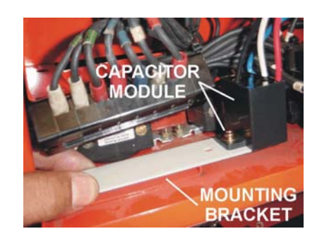
Figure 10. Mounting Bracket

5. Using the M4 hex nut, lock washer and flat washer, attach the capacitor module to the mounting bracket as shown in Figure 10. Align the hole on the capacitor module with the hole on the mounting bracket.