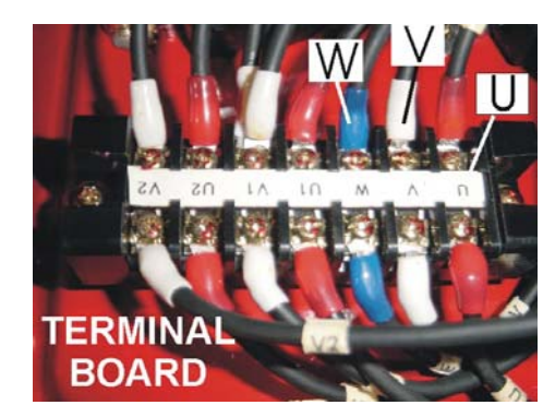
Figure 6. Terminal Board Connections

Route and connect the RED wire on the capacitor module to the U position (contact) on the terminal board as shown in Figure 6. Connect the WHITE wire to the V position (contact) and connect the BLUE wire to the W position (contact) on the terminal board. Use Tie-wraps to secure all wires.