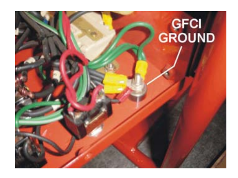
Figure 12. GFCI Ground

7. Route the black wire from the capacitor module as necessary, securing with tie-wraps and connect it to the generator GFCI ground terminal as shown in Figure 12.