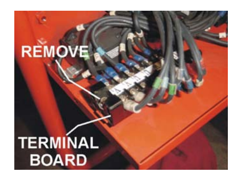
Figure 9. Terminal Board Removal

4. Using a phillips head screwdriver remove the screws securing the terminal board to the generator frame. See Figure 9.