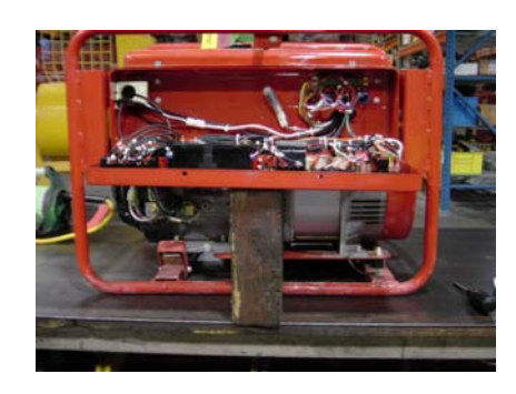
Figure 2. Control Panel Support Block

3. After the four front panel bolts have been removed, pull the control panel forward and tilt downward. To support the control panel, place a wood block underneath as shown in Figure 2.