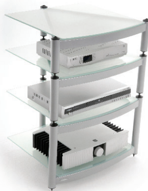
Silver/Arctic Frost Glass