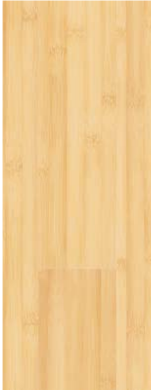
color OH200 natural