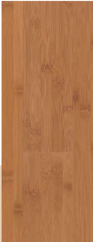
color OH700 carbonized