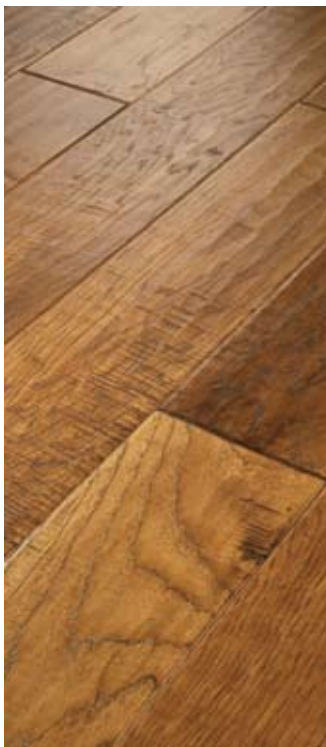
color 214 alamo sunrise