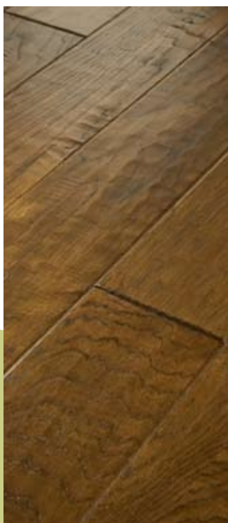
color 303 San Antonio sage