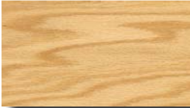
color 774 red oak natural