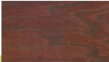
color 850 merlot