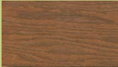
color 914 leather