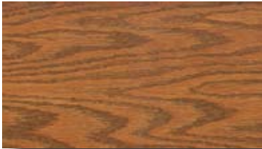
color 780 gunstock