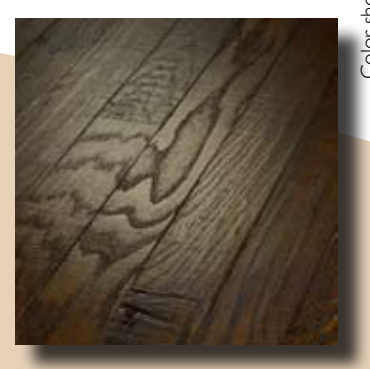
color 932 clubhouse court