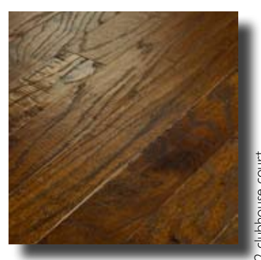
color 868 meadow picnic