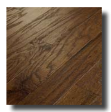
color 305 dogwood spring