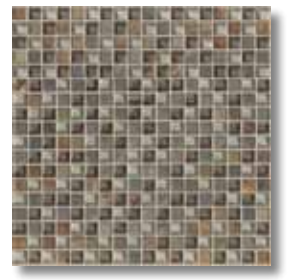
500 Pikes Peak