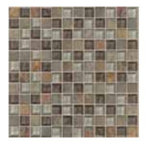
500 Pikes Peak