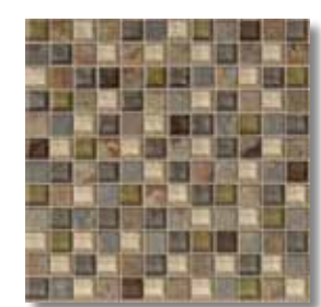
230 Spring Valley