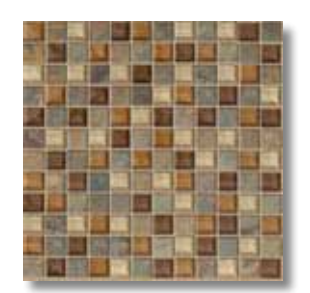
650 Crested Butte