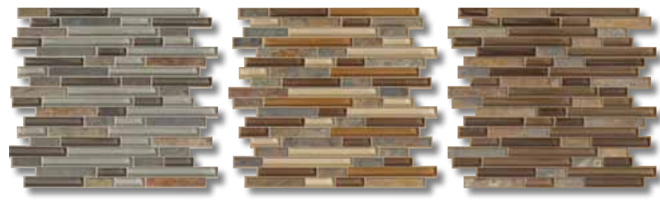
500 Pikes Peak