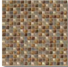
650 Crested Butte