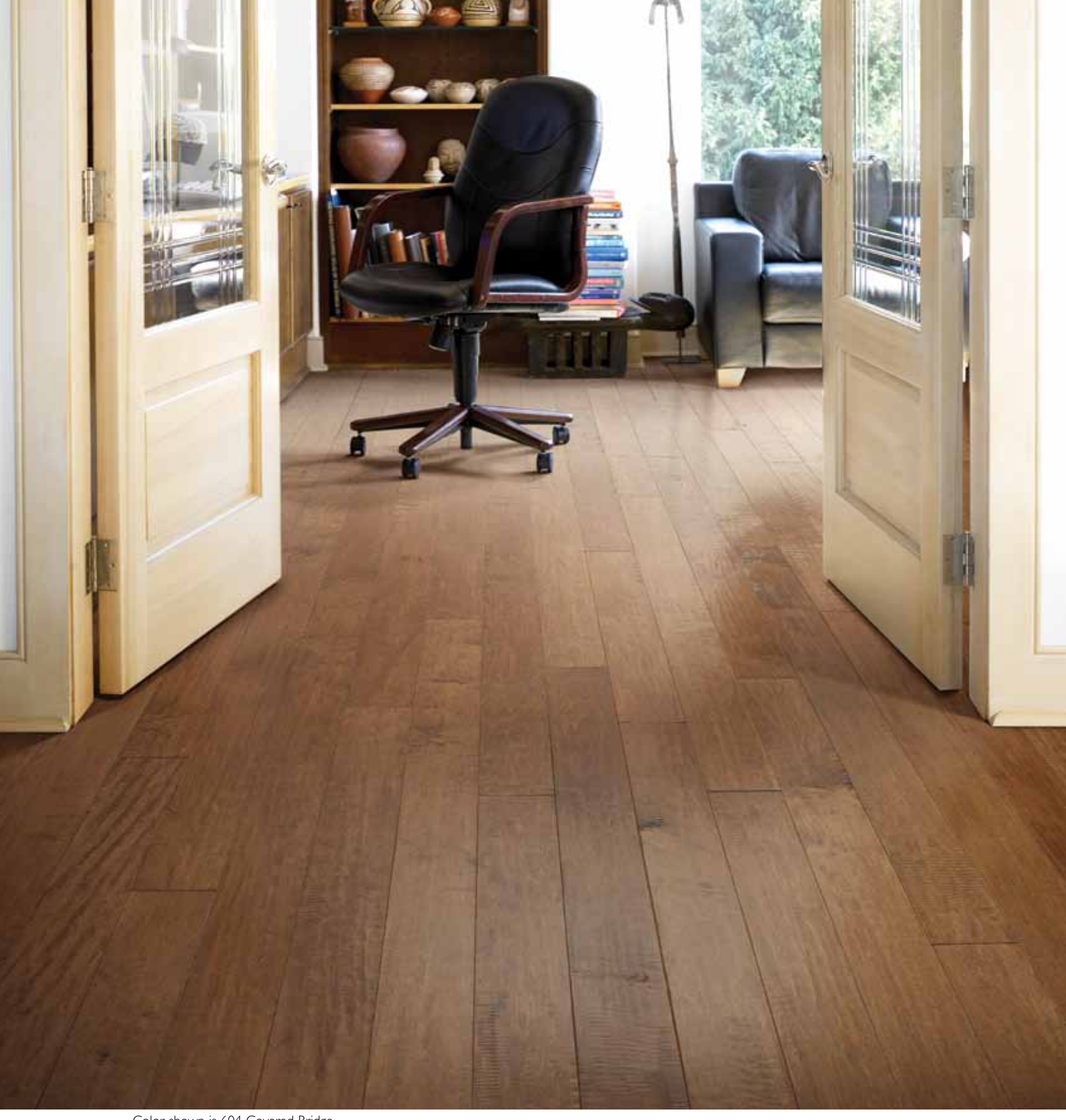
Color shown is 604 Covered Bridge