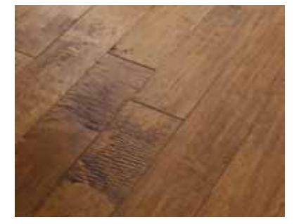
604 Covered Bridge