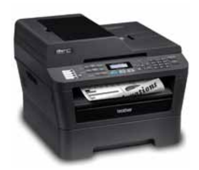
MFC-7860pw Includes all the features of the MFC-7460pn, plus: