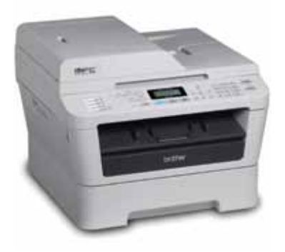
MFC-7360N Print • Copy • Scan • Fax