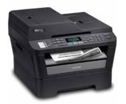
MFC-7460 <sub>DN</sub> Includes all the features of the MFC-7360<sub>N</sub>, plus: