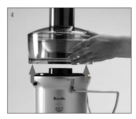
motor base. Take it to the sink for easy cleaning.