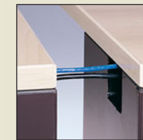
Narrow Support Legs with wire support pass through

Electrical and data wiring easily passes through Adaptabilities notched end panels, grommets and flexible wire ways in hutches.