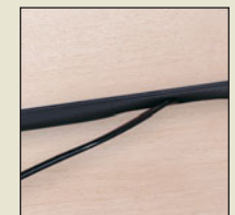
Hutch - Soft wire way for cable management at bottom