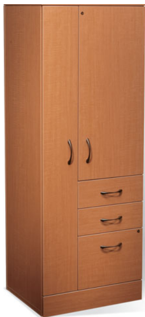
Personal Storage Tower