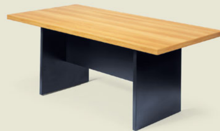
Panel Base – shown with a rectangular top