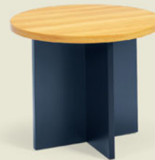
Cross Base – shown with a round top