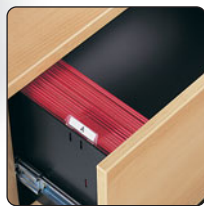
Steel drawer interior