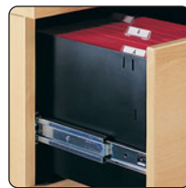
Fully progressive steel ball bearing suspension