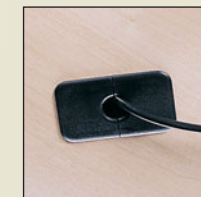
Work Surface grommet / wire pass through