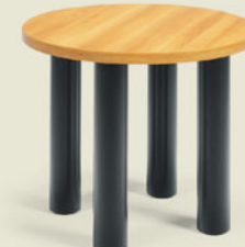
Mono Post Base – shown with a round top

Round, square, rectangular and racetrack table tops can be supported by a variety of base designs.