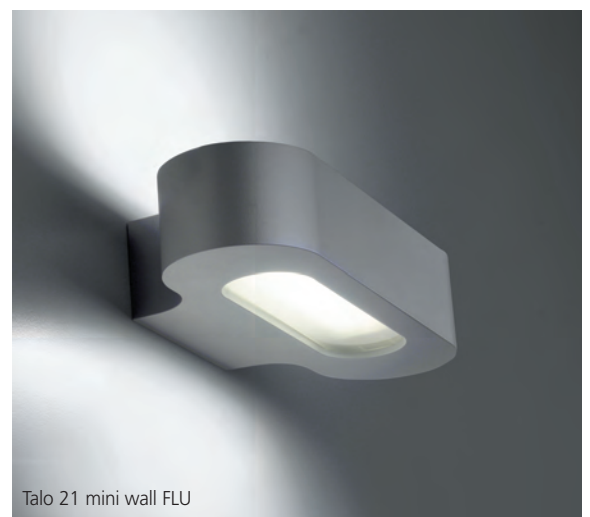
Talo 21 mini wall FLU