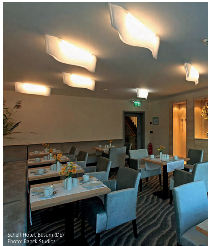
Schelf Hotel, Büsum (DE)