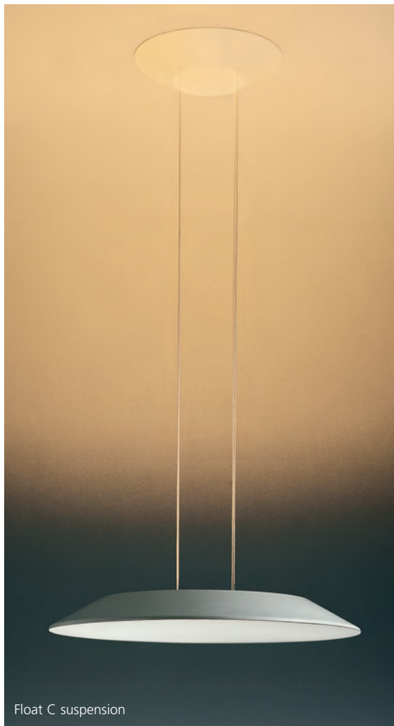
Float C suspension