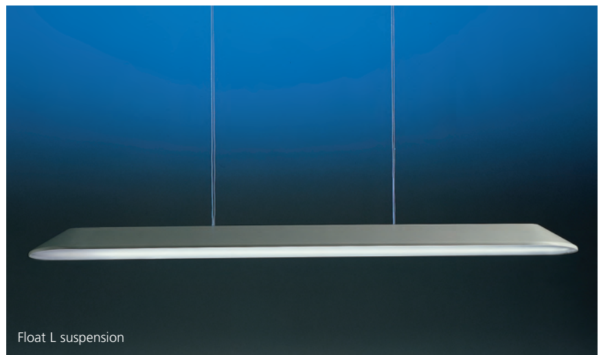
Float L suspension