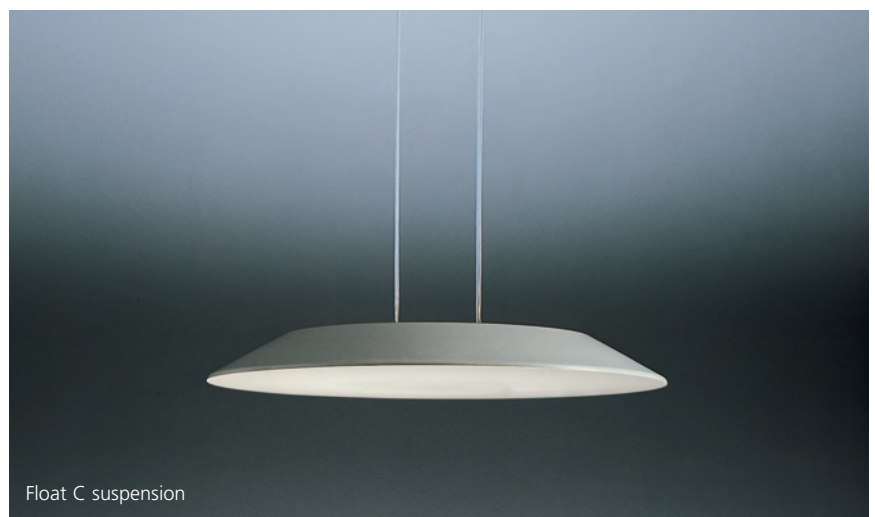
Float C suspension