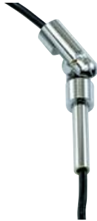
Shown approx. 30% actual size.