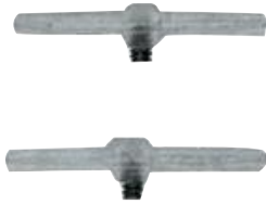
Shown approx. 110% actual size.