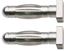
Shown approx. 120% actual size.