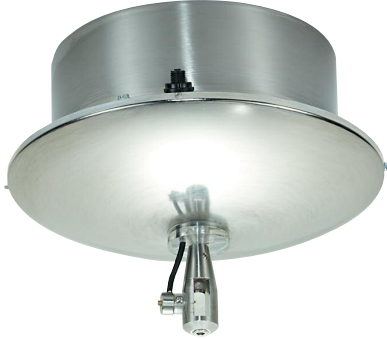
Shown approx. 20% actual size.