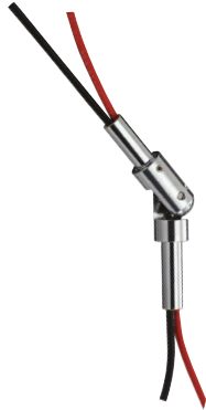
Shown approx. 20% actual size.