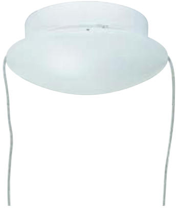
Shown approx. 20% actual size.