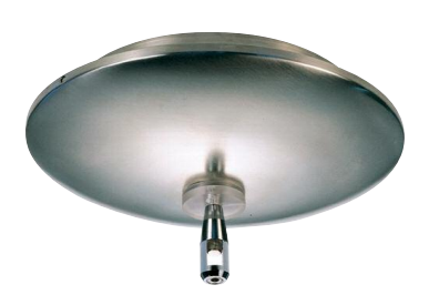
Shown approx. 20% actual size.