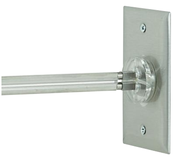
Shown approx. 35% actual size.