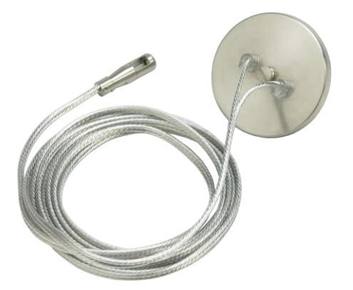
SINGLE-FEED Shown approx. 15% actual size.