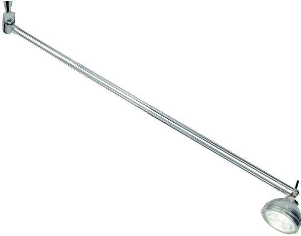
TELE WITH SOLID BACKLIGHT SHIELD ACCESSORY Shown approximately 15% actual size.