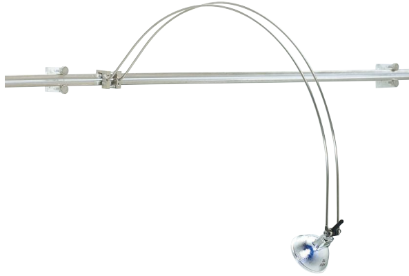
Shown approximately 20% actual size.