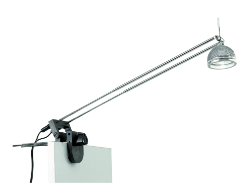
Shown approx. 10% actual size. (with Mesh Backlight Shield Accessory)