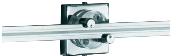
Shown approximately 40% actual size.