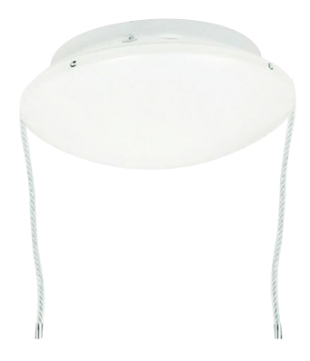
Shown approx. 20% actual size.