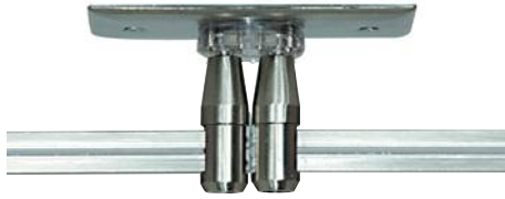
Shown approx. 35% actual size.