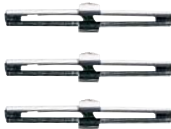
Shown approx. 105% actual size.