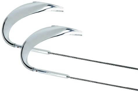
Shown approx. 15% actual size.