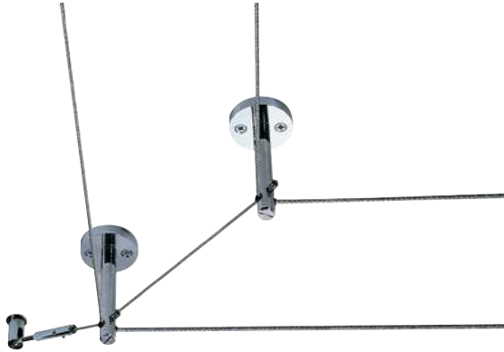
Shown approx. 20% actual size.