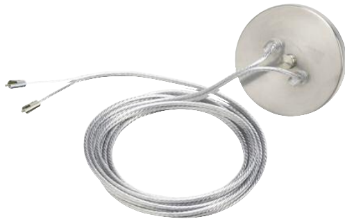
Shown approx. 20% actual size.