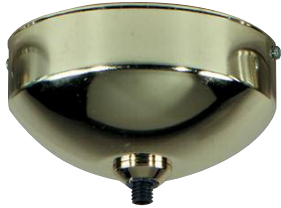
Shown approx. 30% actual size.