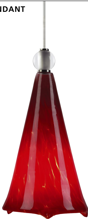
RED FRIT WITH CLEAR BALL Shown approximately 35% actual size.