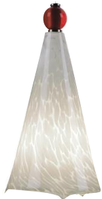
WHITE FRIT WITH RED BALL