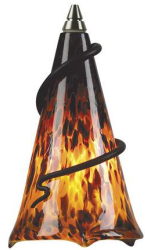
TORTOISE SHELL WITH IRON WRAP ACCESSORY (SOLD SEPARATELY)