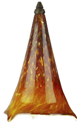
TAHOE PINE AMBER