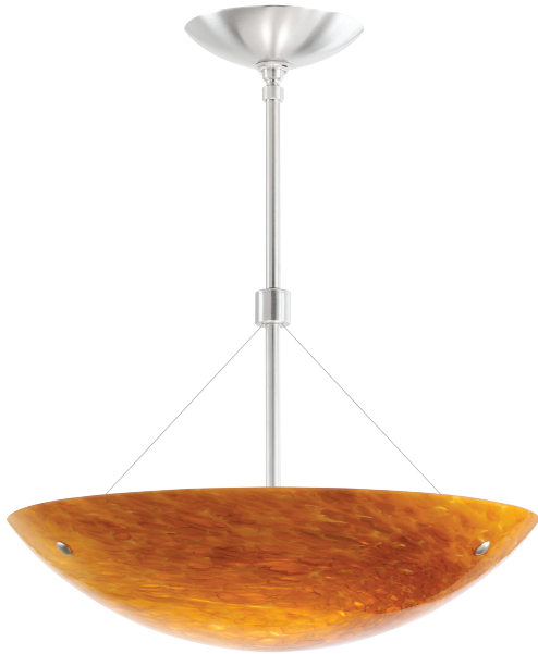
TAHOE PINE AMBER Shown approximately 10% actual size.