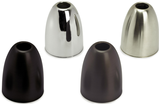
Shown approx. 20% actual size.