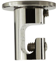
Shown approx. 60% actual size.