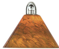
CURLY TORPEDO WITH MARTINI ACCESSORY