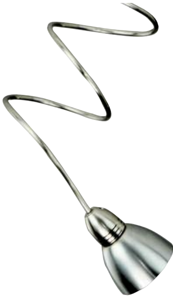
CURLY TORPEDO WITH TINKERBELL ACCESSORY Shown approximately 25% actual size.