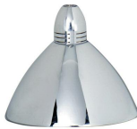
CURLY TORPEDO WITH BELLADONNA ACCESSORY