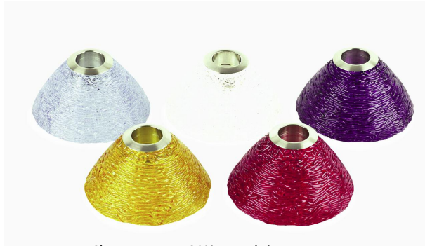
Shown approx. 30% actual size.